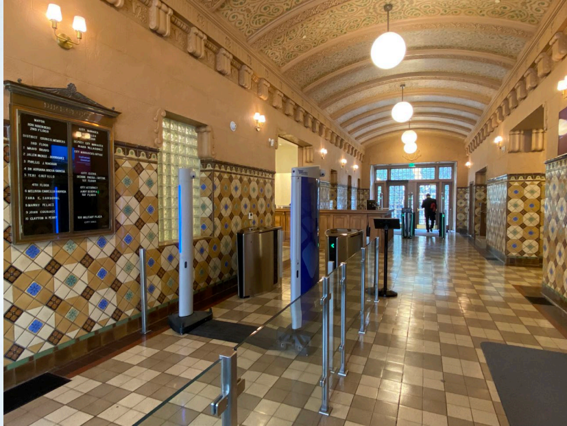
Level 1 East Entrance Lobby Evolv and Speed Gates