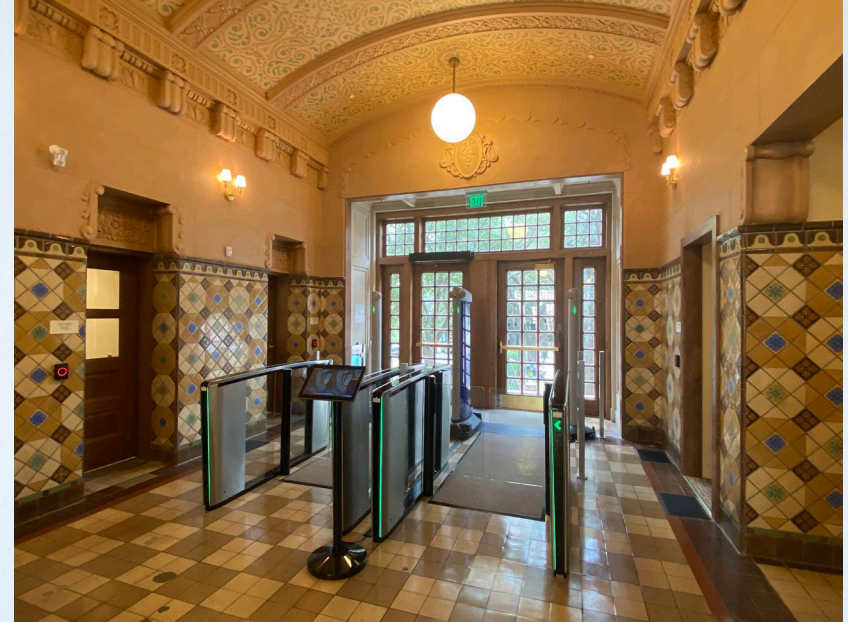
Level 1 West Entrance Lobby Evolv and Speed Gates