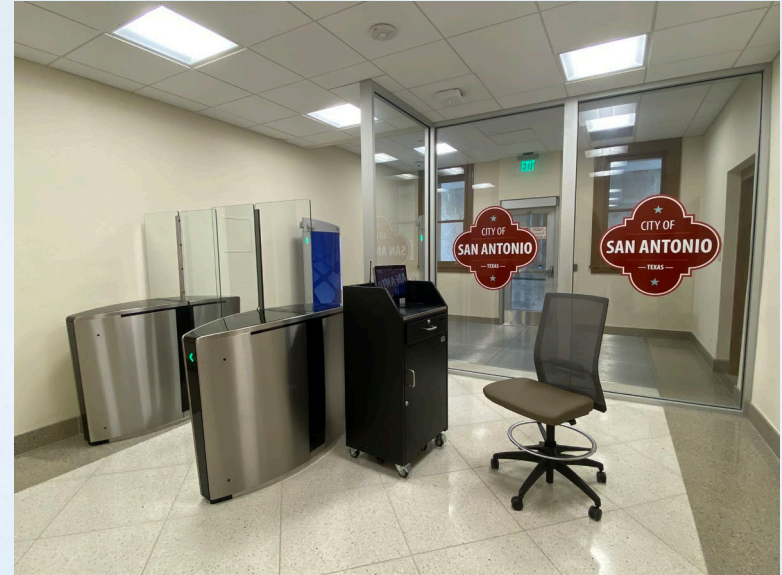
Basement Evolv and Speed gates